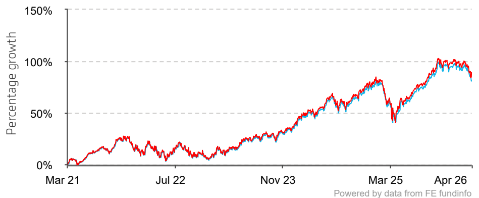
■ Aegon HSBC Life Islamic Global Equity Index (ARC) ■ Dow Jones Islamic Market Titans 100

In the graph, performance is shown since launch if the fund is less than five years old.