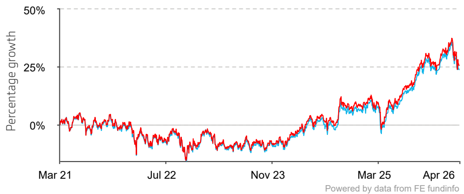
■ Scottish Equitable Emerging Markets Equity Tracker (ARC) ■ FTSE Emerging

In the graph, performance is shown since launch if the fund is less than five years old.